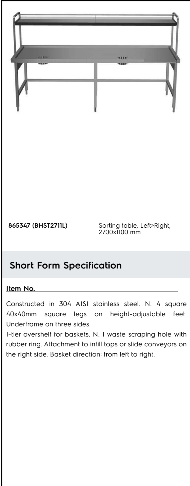
865347 (BHST2711L) Sorting table, Left>Right, 2700x1100 mm